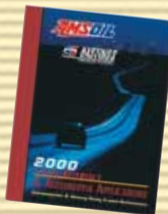
G-194 Cross Reference and Automotive Applications Guide