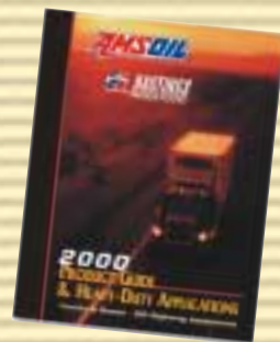
G-1555 Hastings Product and Heavy Duty Applications Guide